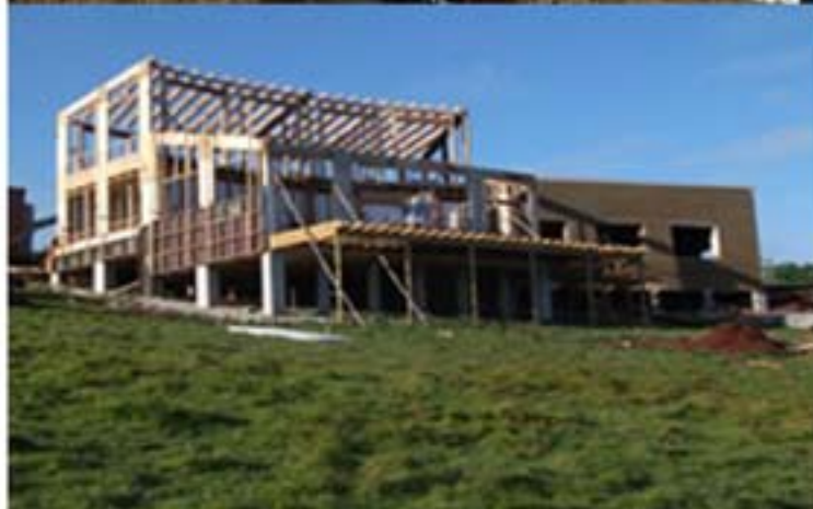
Residential Hemp House Australia