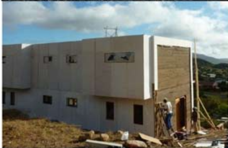
Prototype Hemp House South Africa