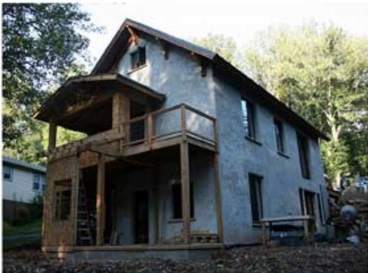
Nauhaus Asheville USA